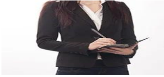
Secretary & Admin