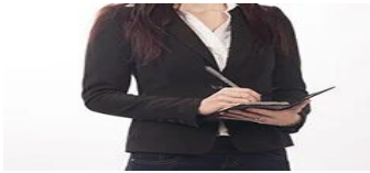
Secretary & Admin