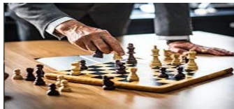
Leadership & Management Development