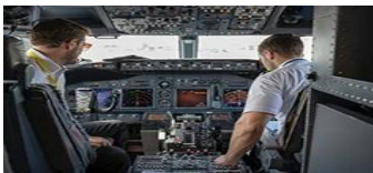
Aviation, Transportation & Logistics