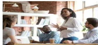
Professional Skills & Career Enhancement