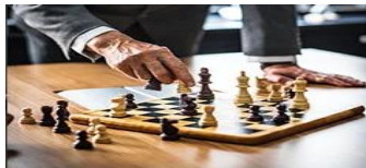
Management & Leadership