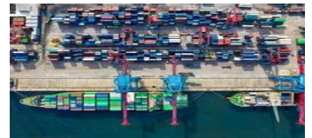
Customs Management & Global Trade Compliance