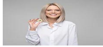
Finance, Accounting, Budgeting