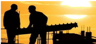
Health & Safety