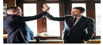
Marketing, Sales, Customer Service