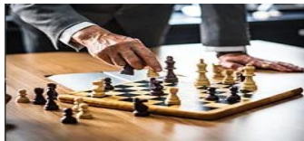
Management & Leadership