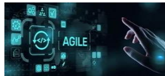
Agile and Refinement