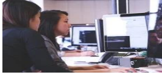
Audit & Quality Assurance