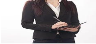
Secretary & Admin