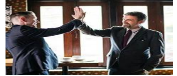
Marketing, Sales, Customer Service