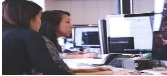
Audit & Quality Assurance