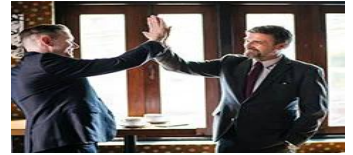
Marketing, Sales, Customer Service