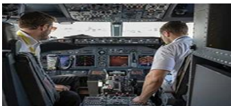
Aviation, Transportation & Logistics