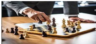
Leadership & Management Development