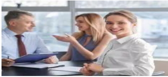
Human Resources Management