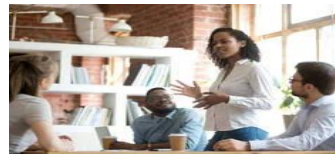
Professional Skills & Career Enhancement