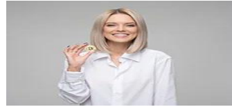
Finance, Economics & Markets