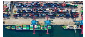
Customs Management & Global Trade Compliance