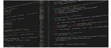
Technology & Digital Transformation