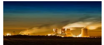
Oil, Gas & Energy Industry Specialization