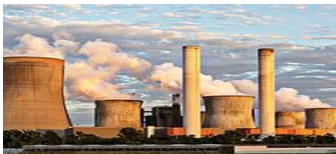
Procurement, Contracts & Supply Chain