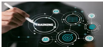
Board Members & C-Suite Development