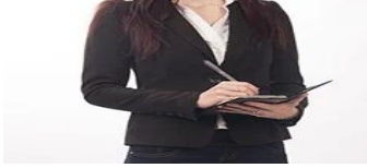
Secretary & Admin