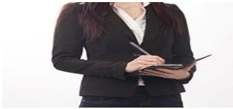
Secretary & Admin