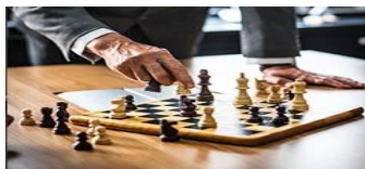
Management & Leadership