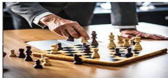
Management & Leadership