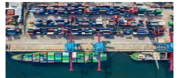
Customs & Safety