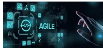
Agile and Refinement