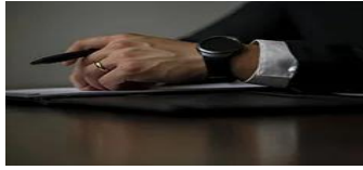
Law and Contract Management