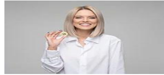
Finance, Accounting, Budgeting