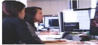
Audit & Quality Assurance