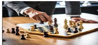
Management & Leadership