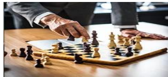
Management & Leadership