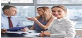
Human Resources Management