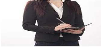
Secretary & Admin