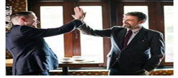
Marketing, Sales, Customer Service