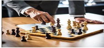
Management & Leadership