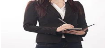
Secretary & Admin