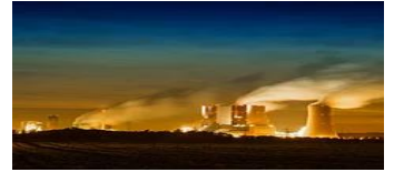
Oil & Gas Engineering