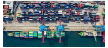
Customs & Safety