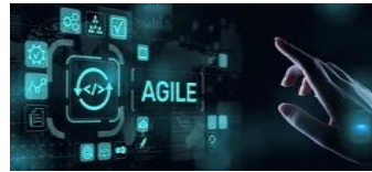
Agile and Refinement