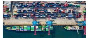
Customs & Safety