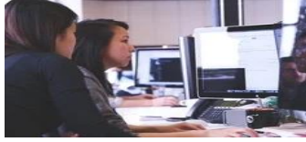
Audit & Quality Assurance