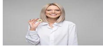
Finance, Accounting, Budgeting