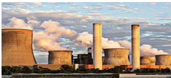
Supply Chain & Logistics