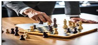
Management & Leadership