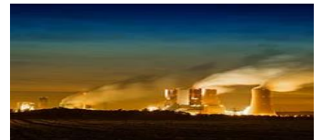
Oil & Gas Engineering