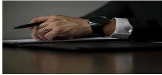
Law and Contract Management