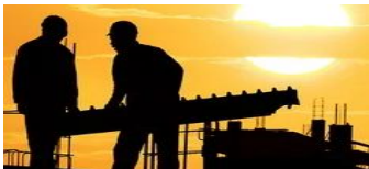
Health & Safety